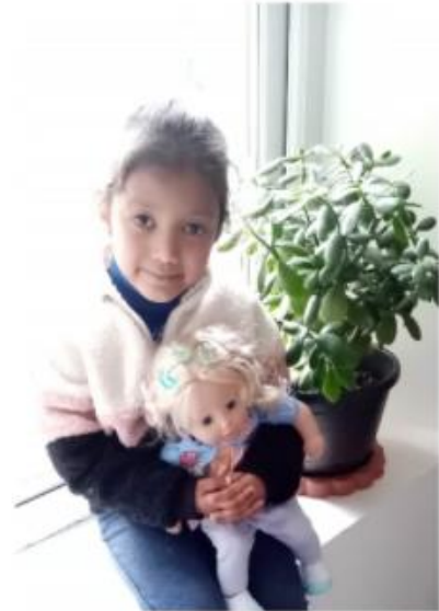
Me and my doll are next to the plant.