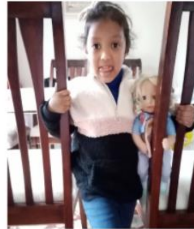
Me and my doll are standing in between the chairs.