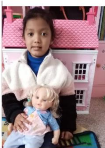
Me and my doll are in front of my doll house.