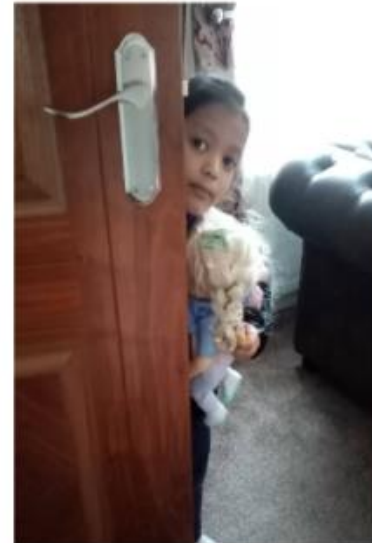
Me and my doll are behind the door.