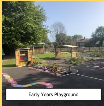
Early Years Playground