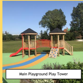
Main Playground Play Tower