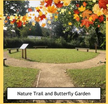
Nature Trail and Butterfly Garden