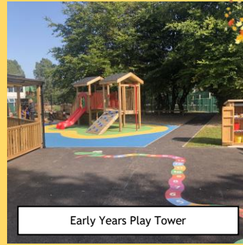
Early Years Play Tower