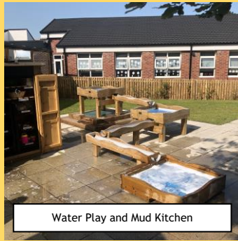
Water Play and Mud Kitchen