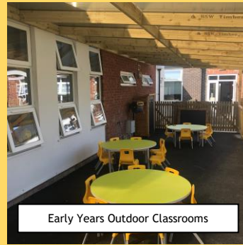
Early Years Outdoor Classrooms