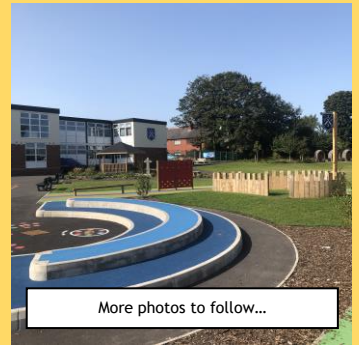
More photos to follow...