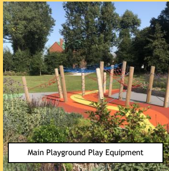
Main Playground Play Equipment