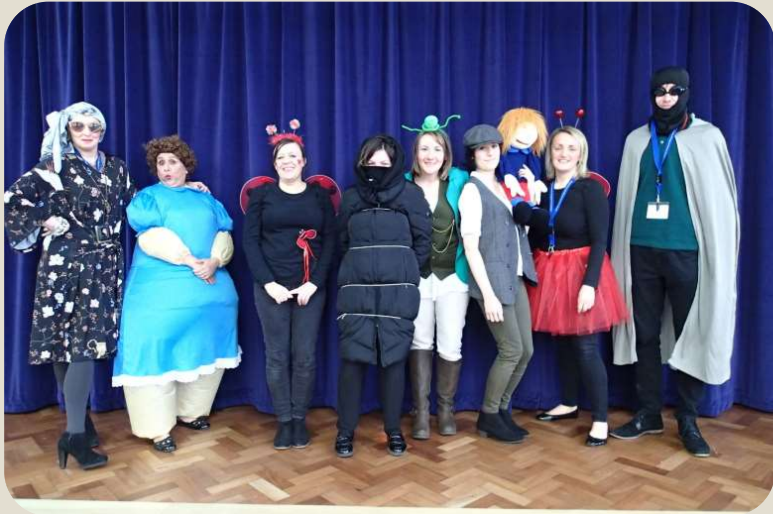
James and the Giant Peach! ~ EYFS Staff