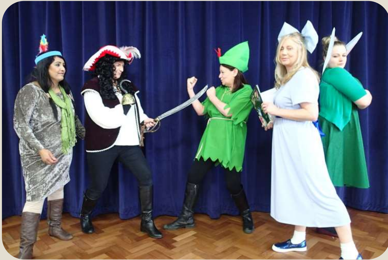
Peter Pan! ~ Year 1 Staff