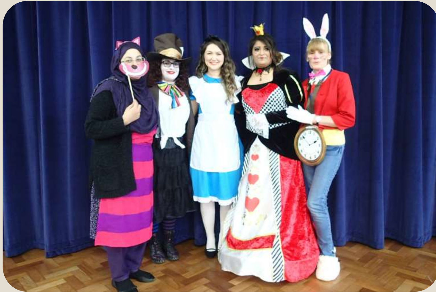
Alice in Wonderland! ~ Year 5 Staff