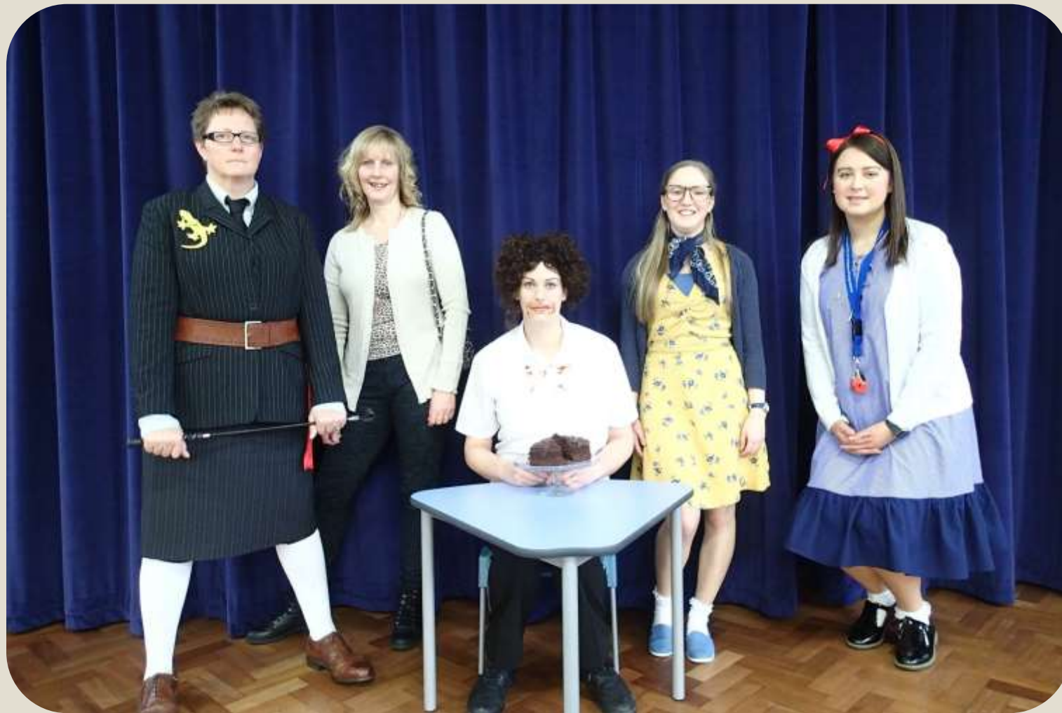
Matilda! ~ Year 2 Staff