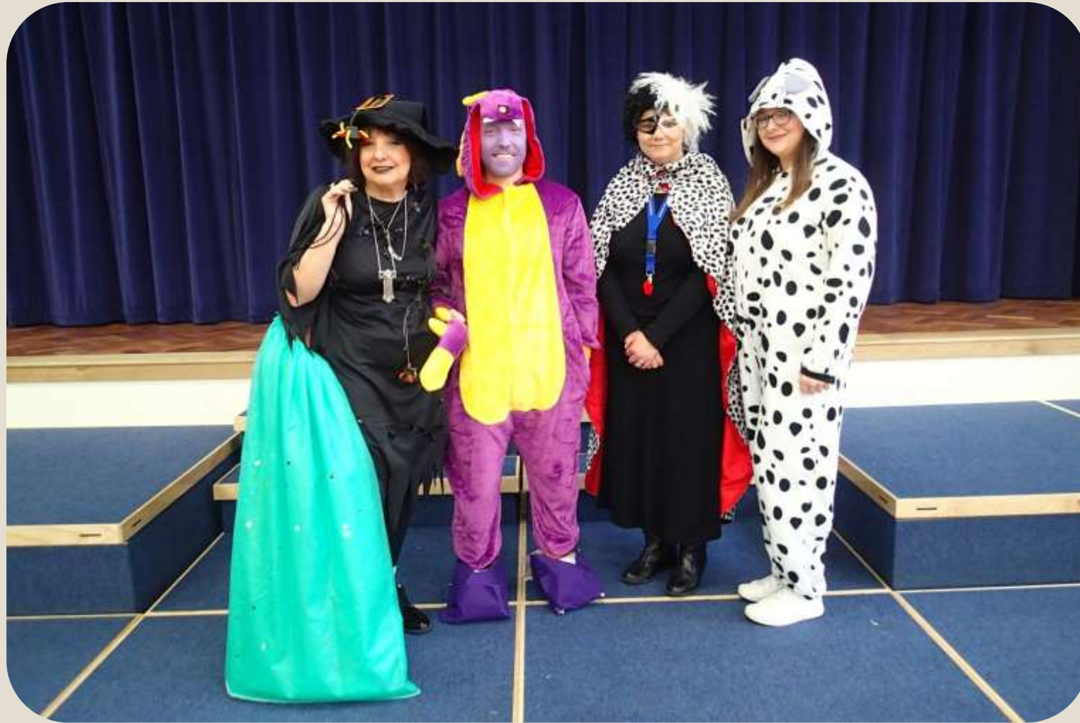
The Lost Happy Endings! ~ Year 4 Staff