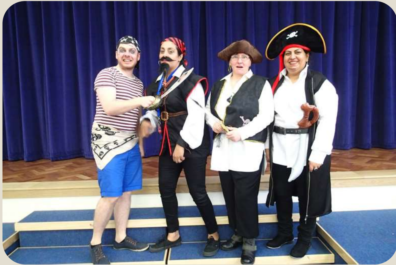
Treasure Island! ~ Year 3 Staff