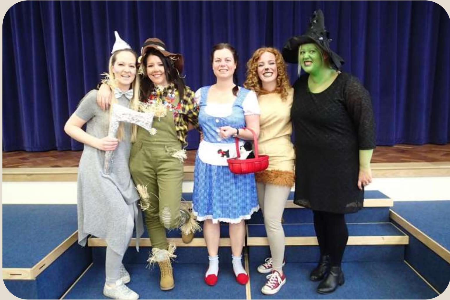
The Wonderful Wizard of Oz! ~ Year 6 Staff